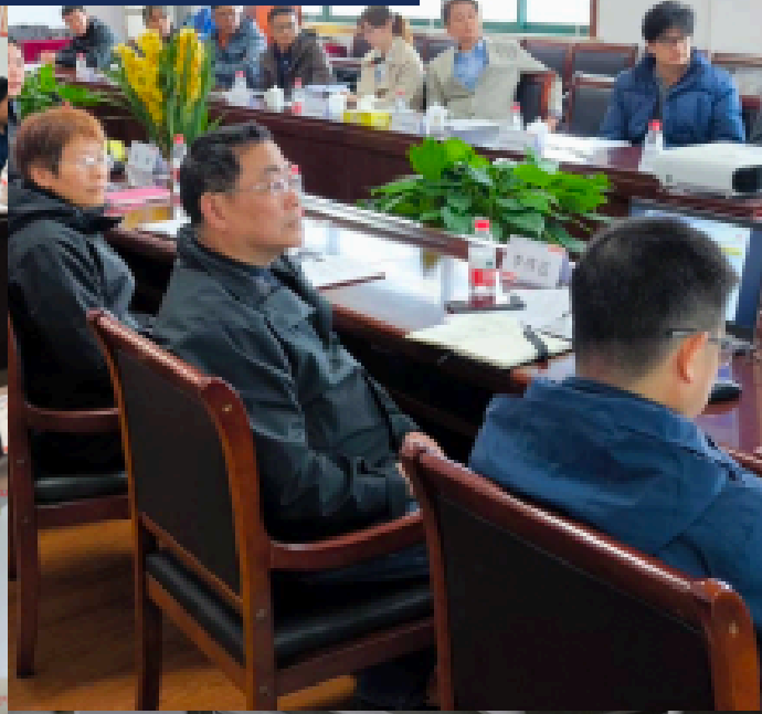
HS CHAIN — HAILAND SUGAR INDUSTRY CUSTOMERS' PHOENIX ON-CHAIN TECH & TRADE COOPERATION